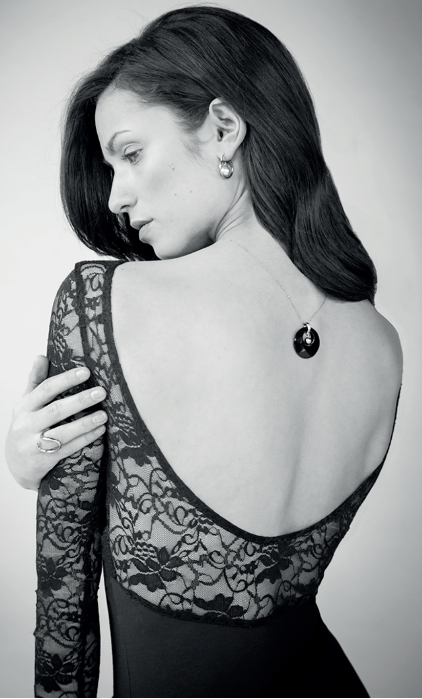
ONYX ROSE GOLD PENDANT