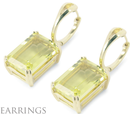
LEMON QUARTZ EARRINGS