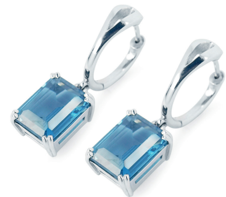
LONDON BLUE TOPAZ EARRING