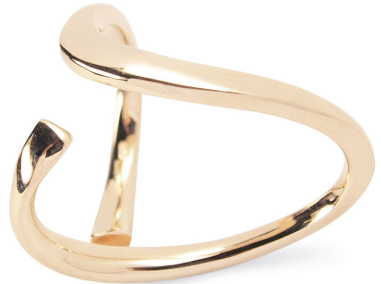
ROSE GOLD TWIST RING