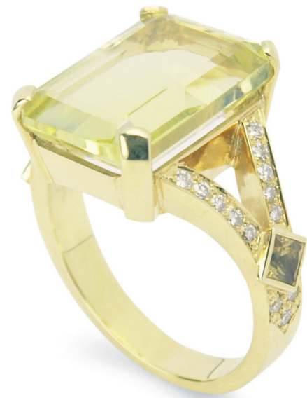
LEMON QUARTZ, DIAMOND RING