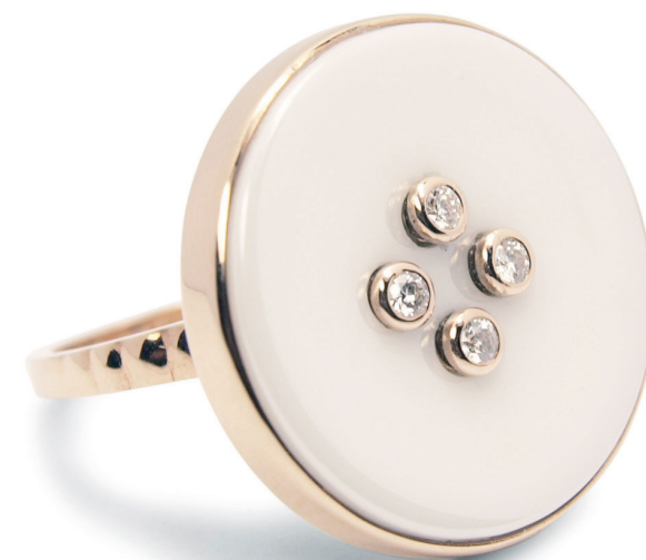
ROSE GOLD CERAMIC RING