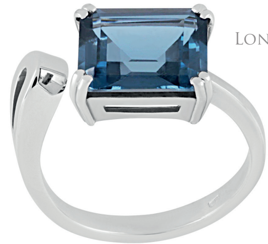
LONDON BLUE TOPAZ RING