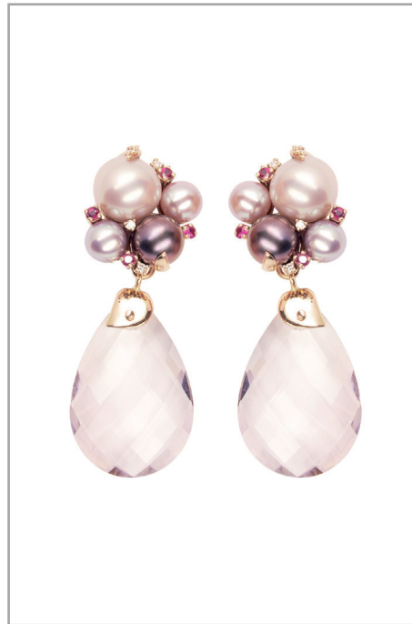
BOQUET AMETHYS EARRING